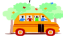
Bus and Chaperone parking and Student Drop-off